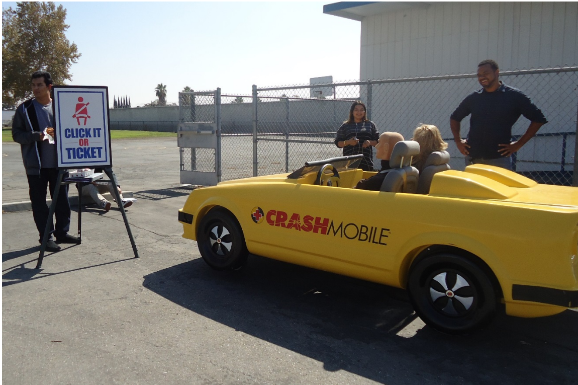
Dummies occupy a crash car that demonstrates the results of a vehicle accident.