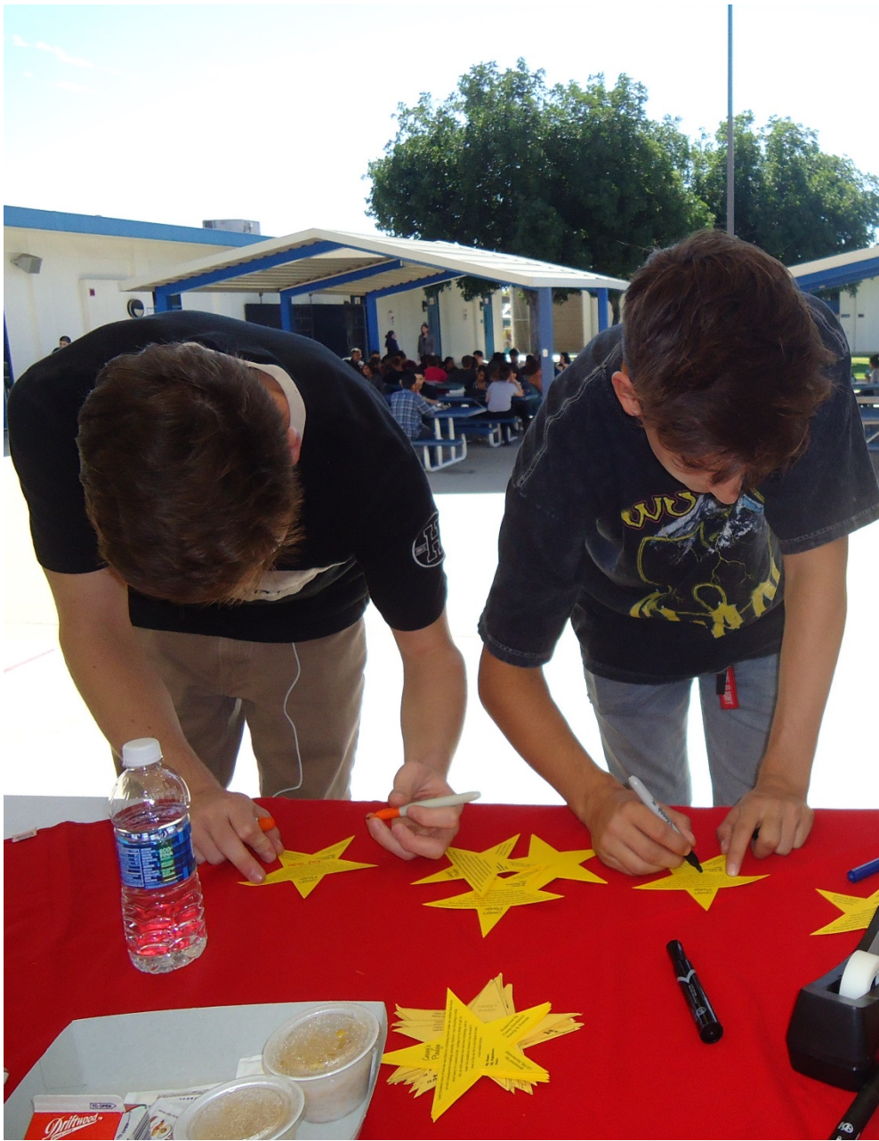
Buena Vista High students sign pledges to not drink alcohol and drive.