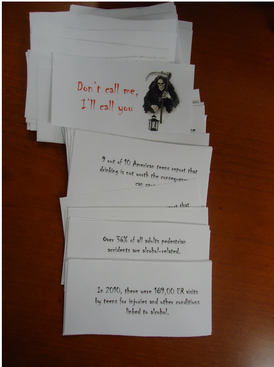
Driving under the influence facts compiled by Buena Vista High Leadership students.