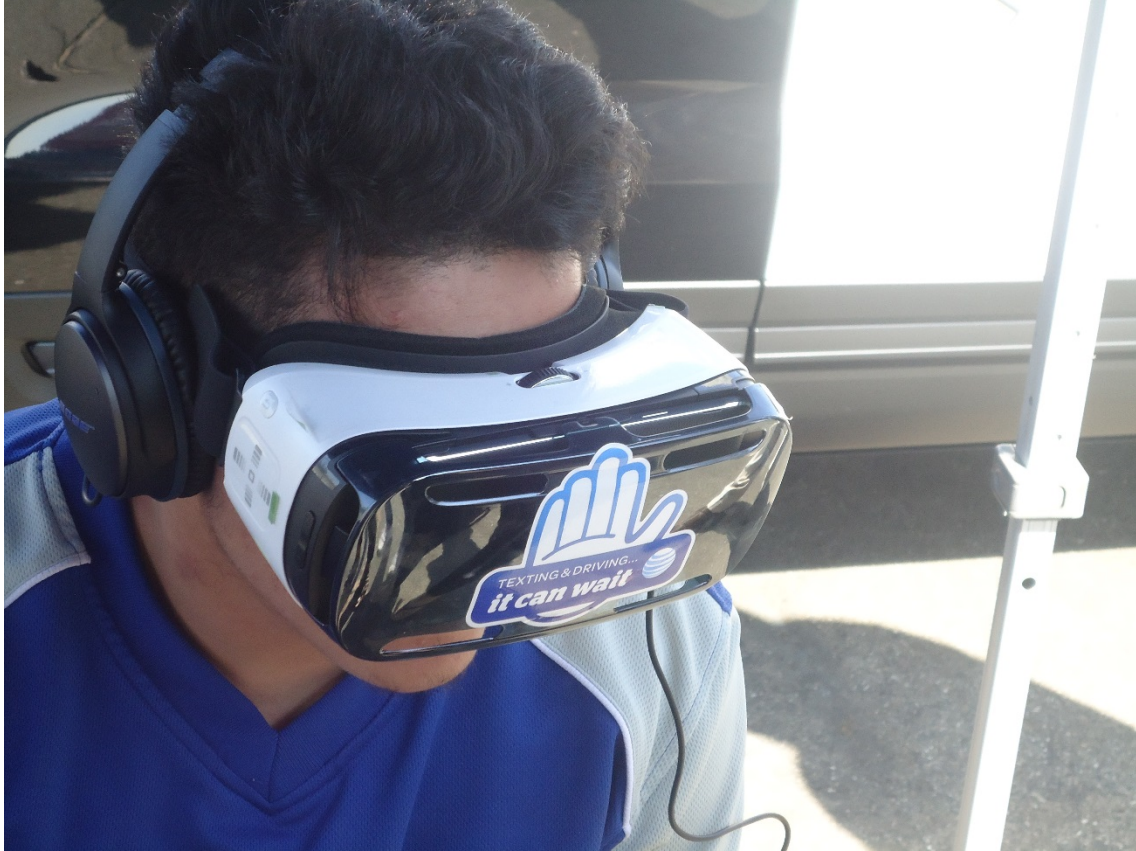
A student tries out a virtual reality device, showing the experience of distracted driving.