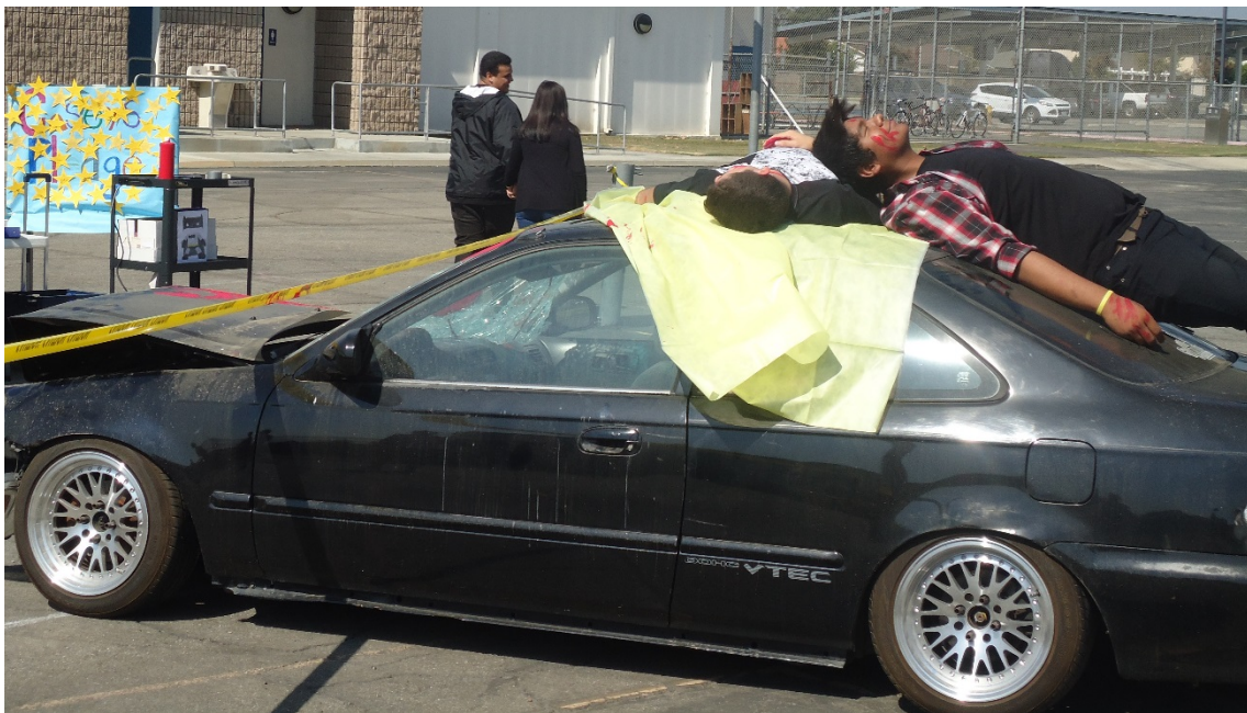
A deadly mock accident is portrayed on the Buena Vista High campus during the Field Day.