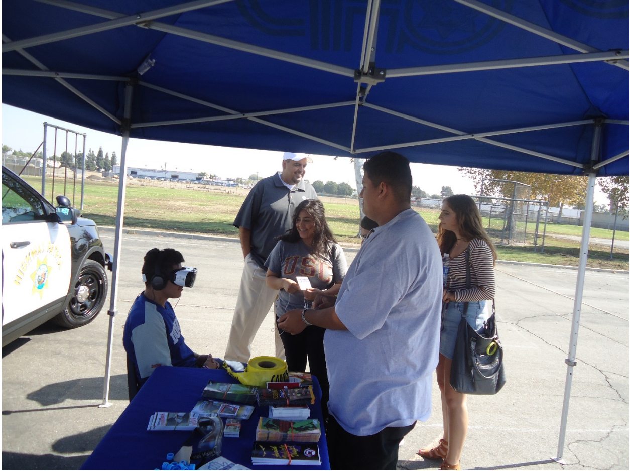
Participants in Buena Vista's recent "Wrecked by Distracted Driving" Field Day wait their turn to try a virtual reality device that depicts distracted driving.