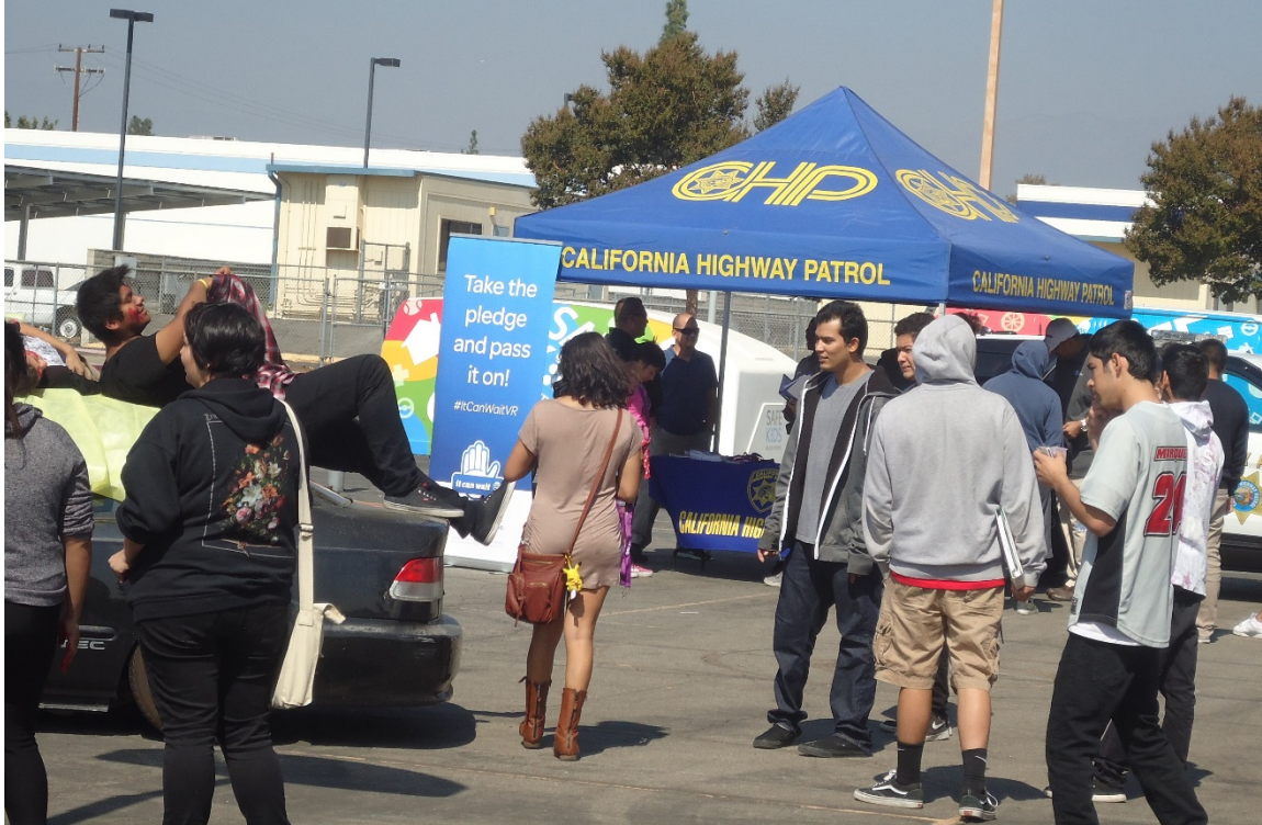
The California Highway Patrol and other local agencies offer information during the Field Day.